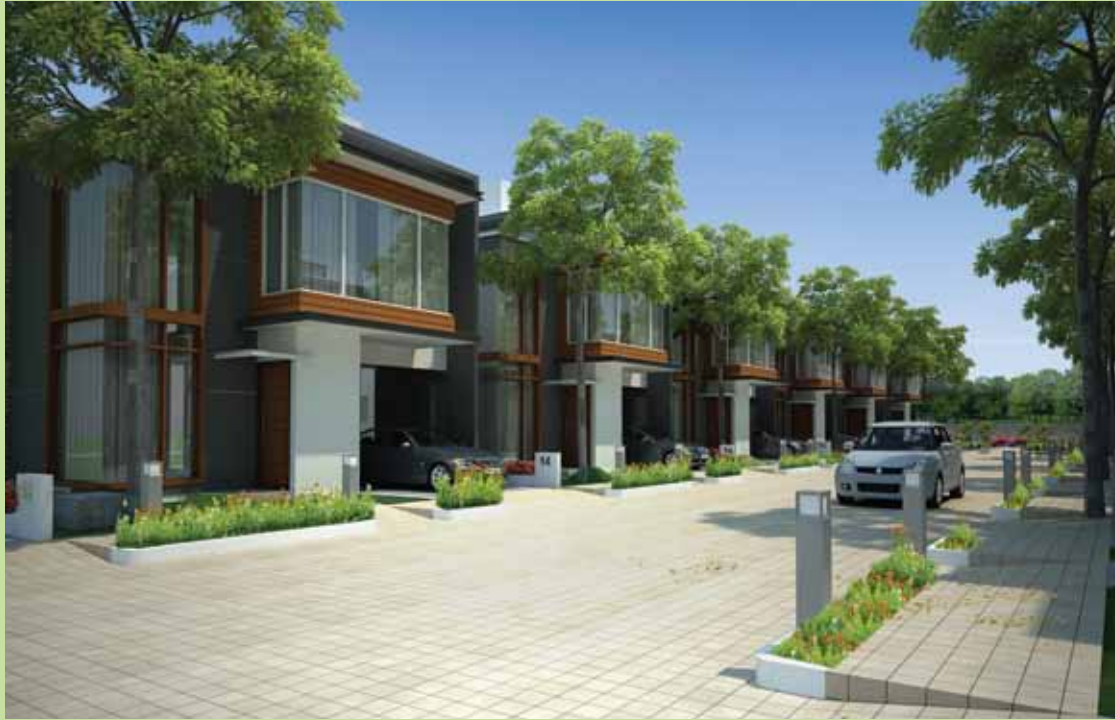
30x40 West facing - Street view