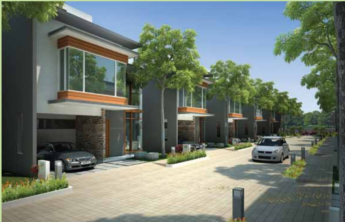
30x50 East facing - Street view