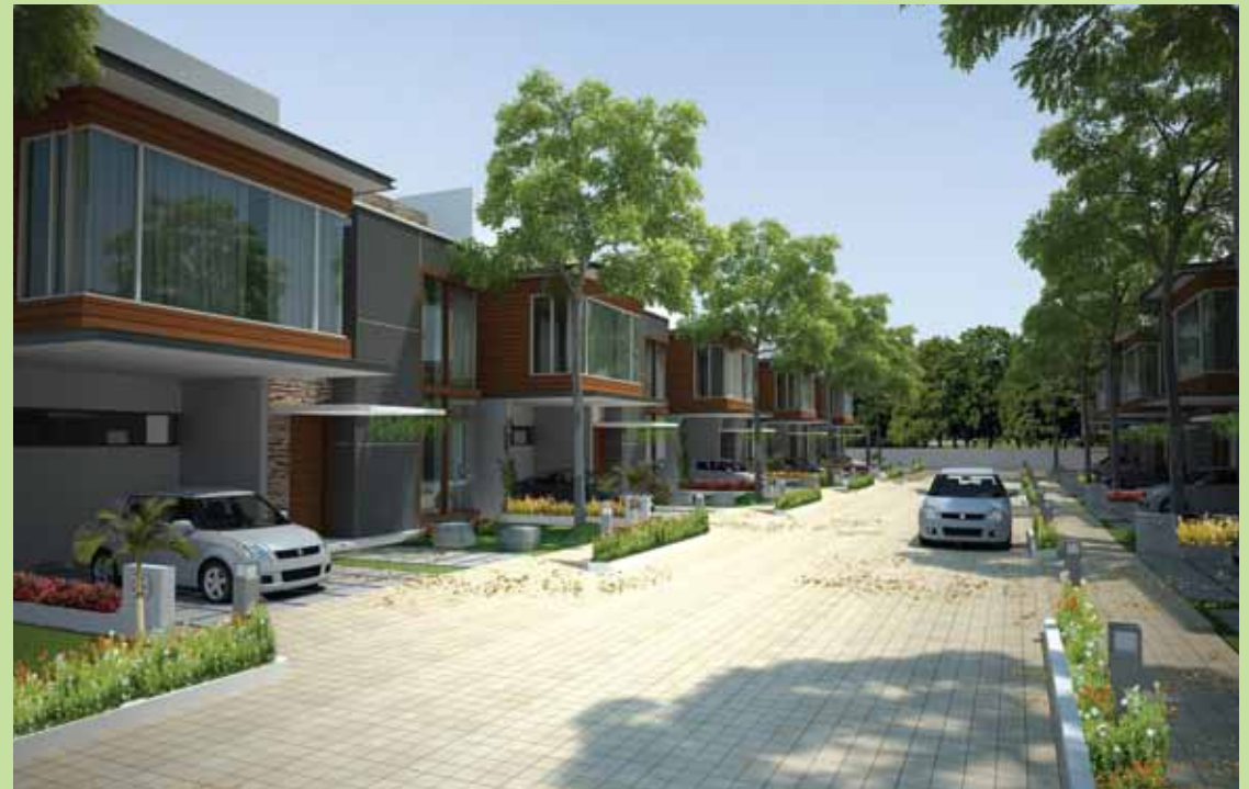
40x60 East facing - Street view