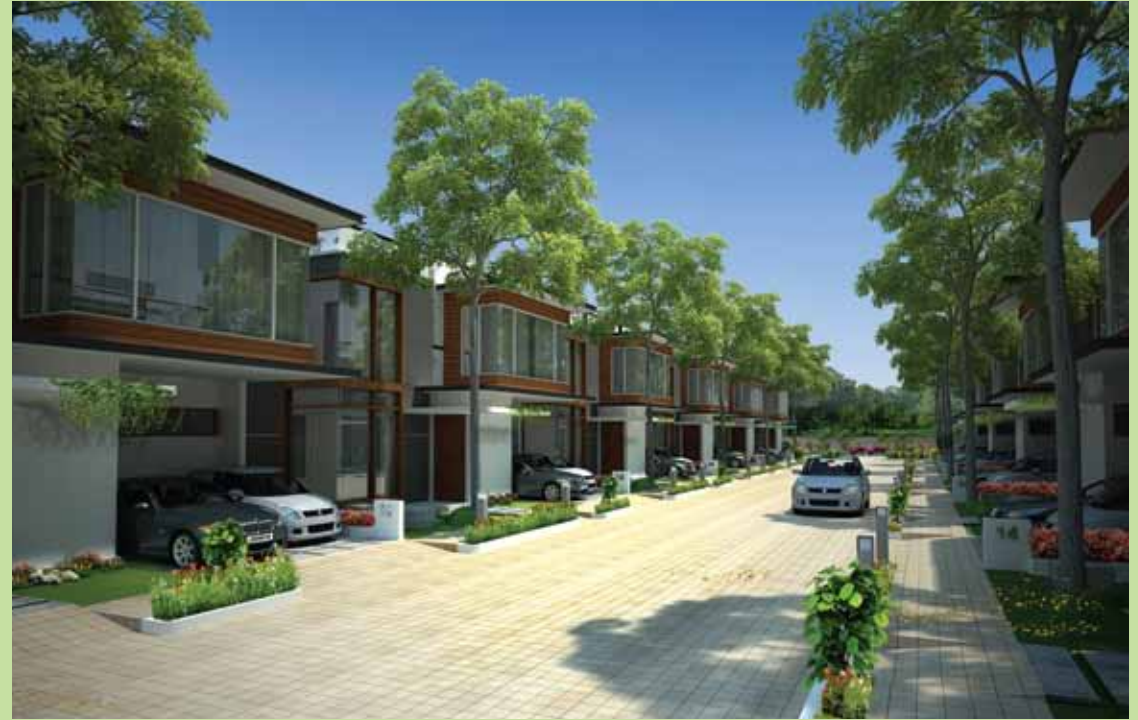
40x60 West facing - Street view